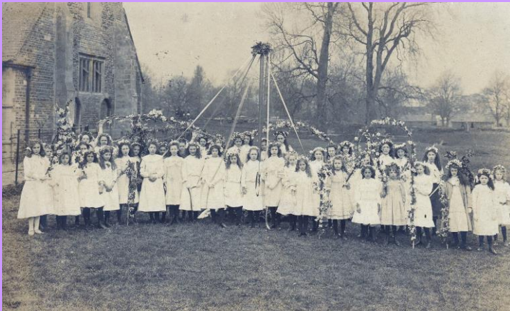
Langham Village, Rutland

£12.00 per person per annum or visitors £3.00 per meeting Membership enquiries: plhsmembership@hotmail.co.uk