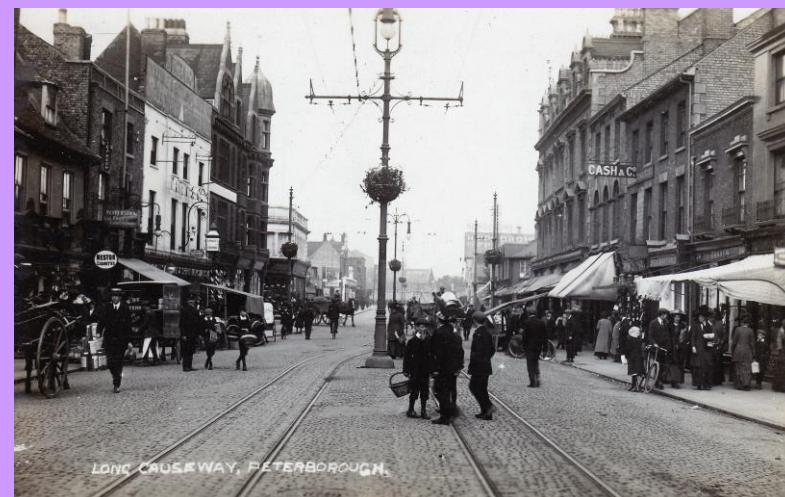
Long Causeway, Peterborough

Meetings are held at 7.30pm in St Mark's Church Hall, 82 Lincoln Road, Peterborough PE1 2SN Parking available